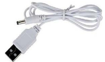
USB Power Cable