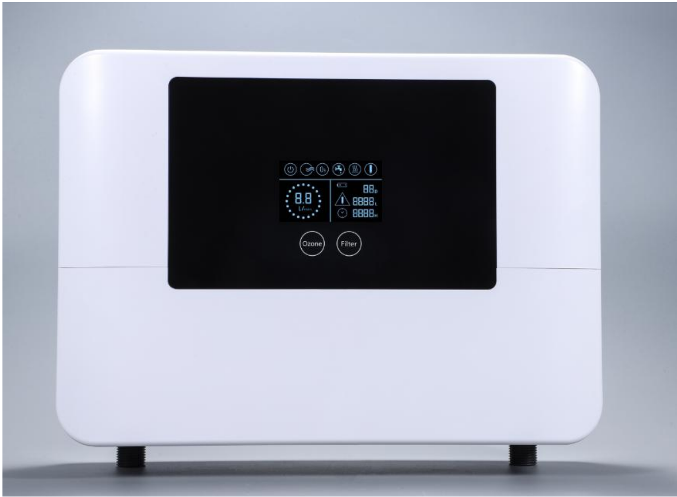
Aquapure (Shenzhen) Ozone Technology Co.,ltd